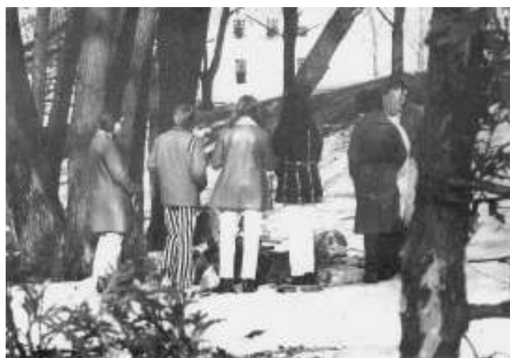
Prayer breakfast on Sabbath morning