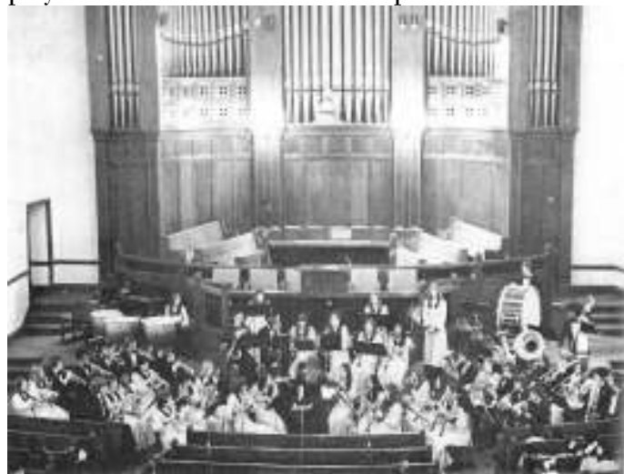
The School Band

In addition to the required high school courses, I joined the band as an elective credit and tried to learn to play the trombone. It was not my instrument of choice because I was intimidated by the fact that you “slid” into each note rather than pushed a precise key, but the band director said they needed trombone players and that I had trombone lips.